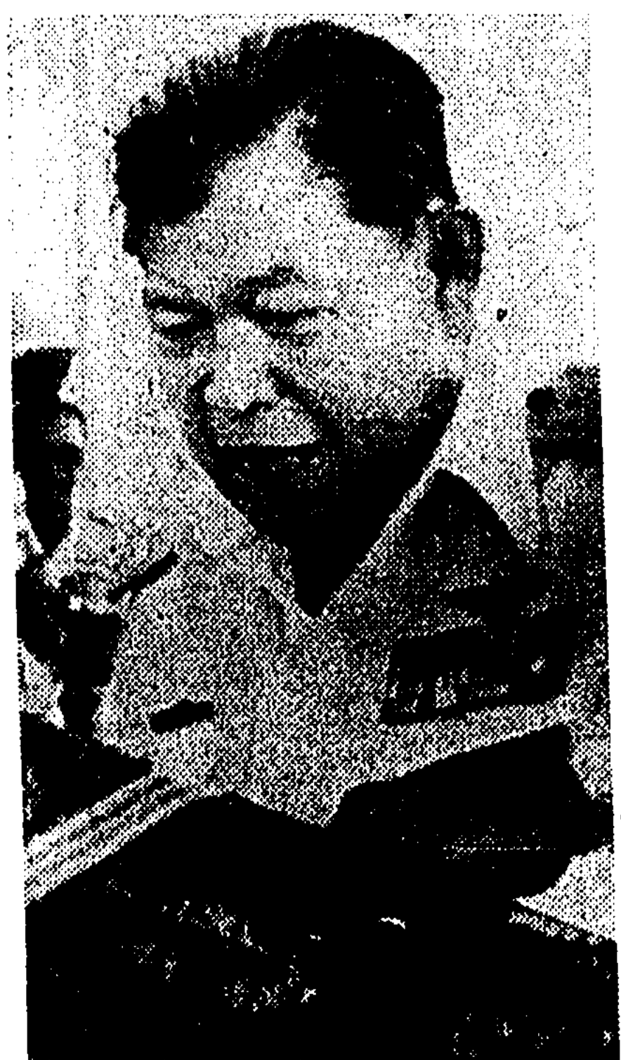
Adm. Sa-ngad Chaloryu, Defense Minister, seized power in Thailand.